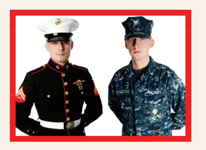
HEROES: Buy or sell a home with us and you will save up to $5,000!!!*